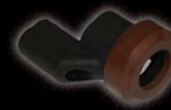
No Mar Part No. 502234