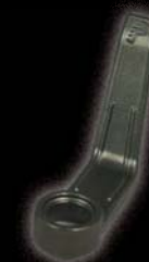
Rafter Hook Kit Part No. B20432